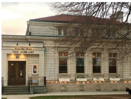
The Library Wine Bar and Bistro